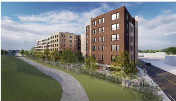
Architectural rendering of 52 New Street

Called a poster project for the Affordable Housing Overlay (AHO), Just A Start leads the way in leveraging the reform to add 106 affordable apartments at 52 New Street. The project was the first permitted for the AHO.